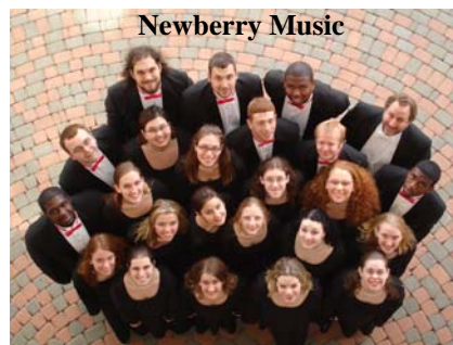
Things are looking UP!